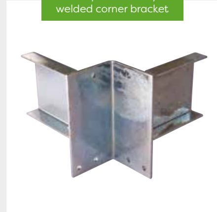
Zinc plated 2 way welded corner bracket