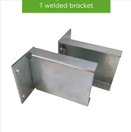
Zinc plated half T welded bracket