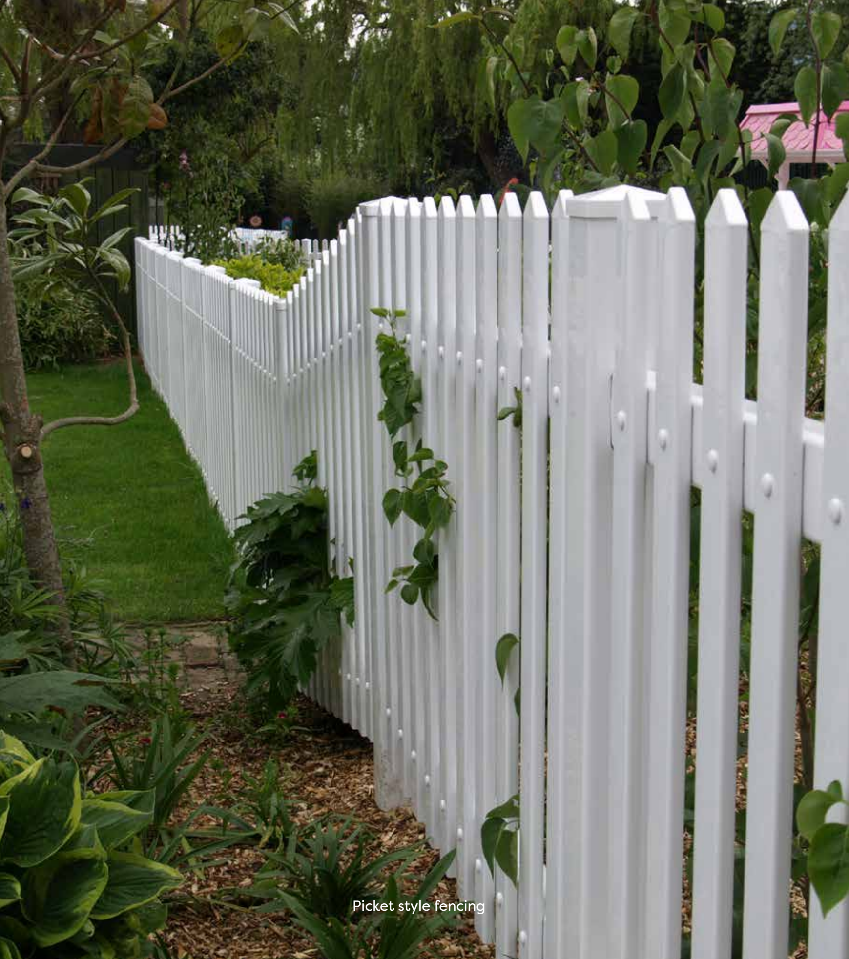
Picket style fencing