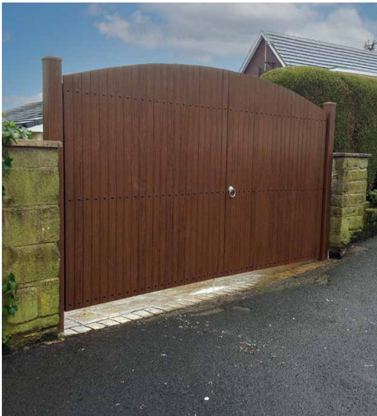
Double driveway gate in Rustic Oak