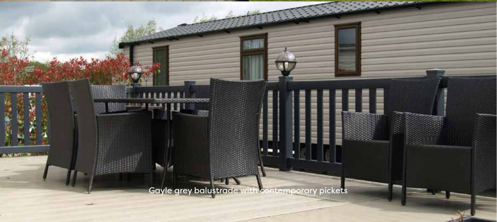
Gayle grey balustrade with contemporary pickets