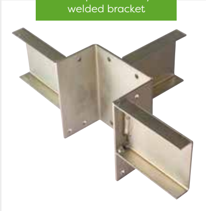
Zinc plated 3 way welded bracket