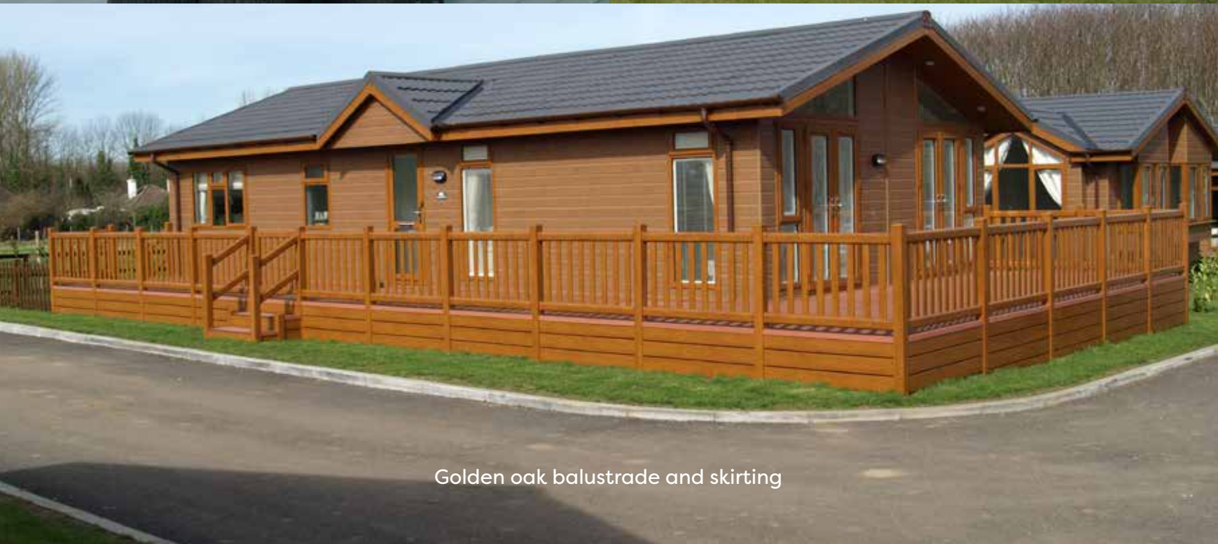
Golden oak balustrade and skirting