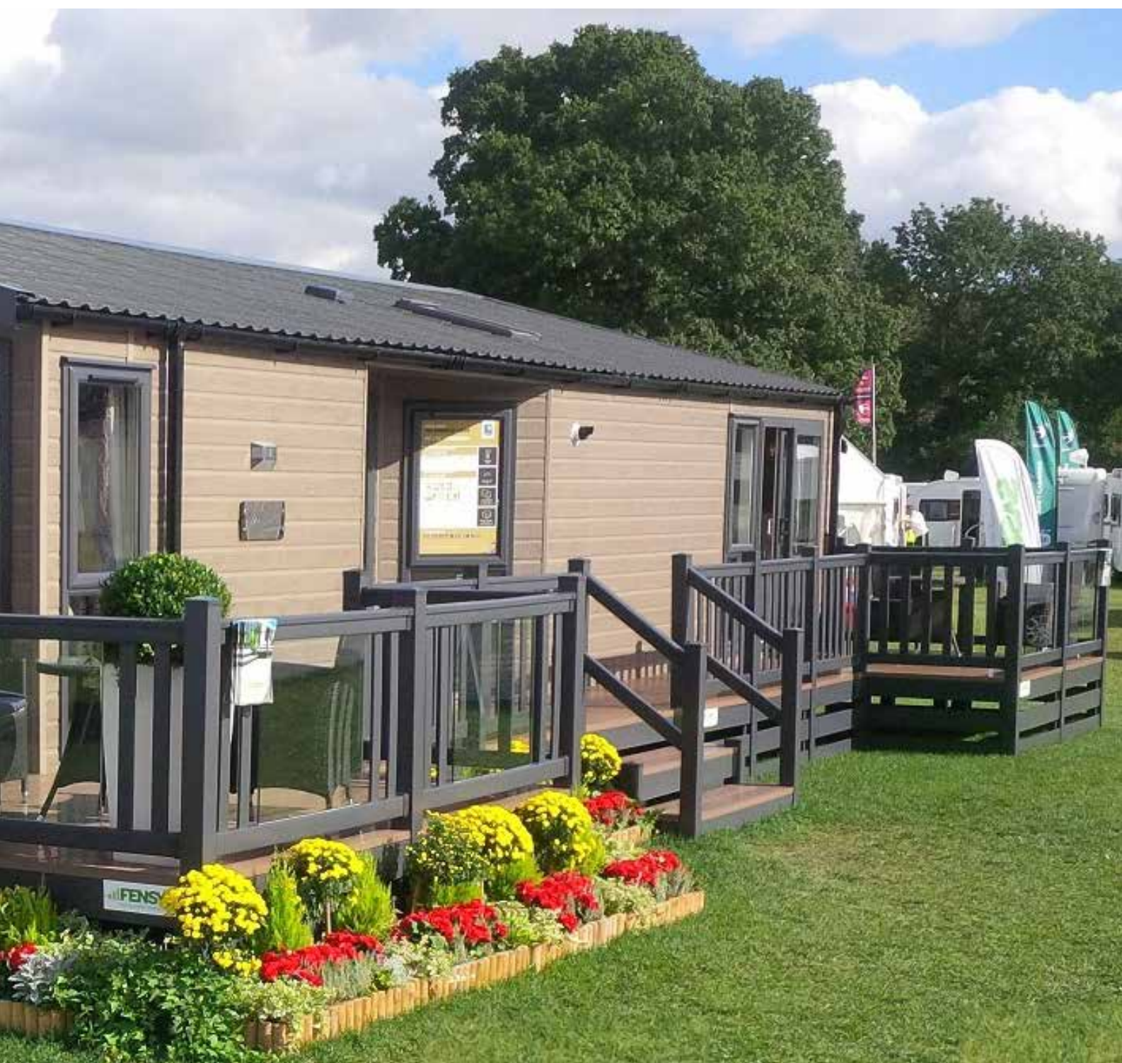
Gayle Grey balustrade with glass panels