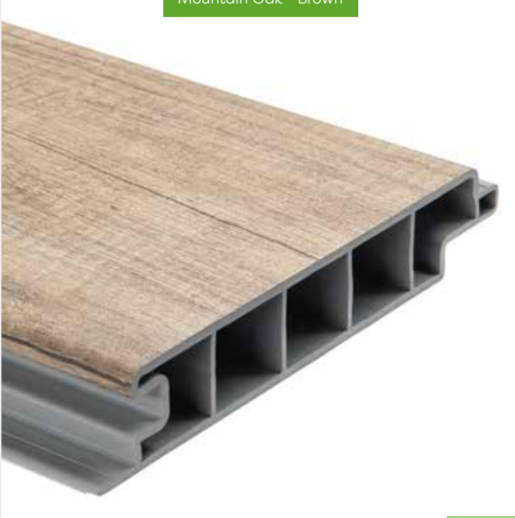
Mountain Oak - Brown