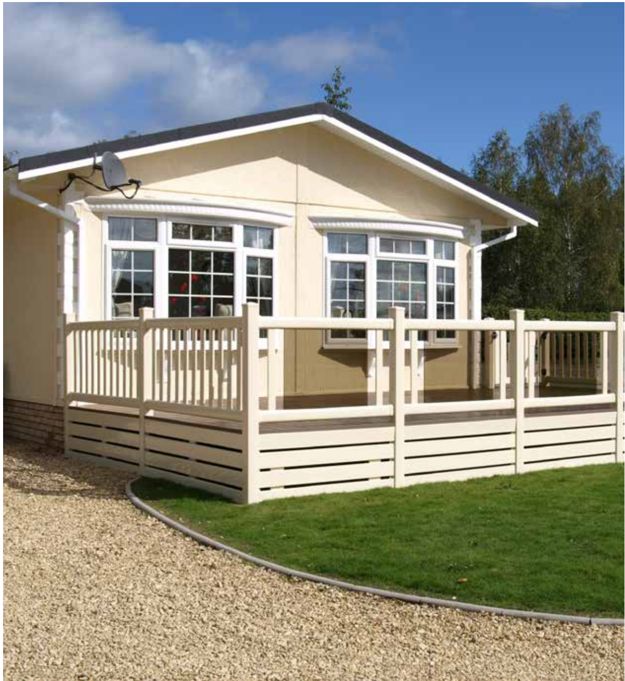
Cream balustrade with contemporary pickets and tinted glass panels